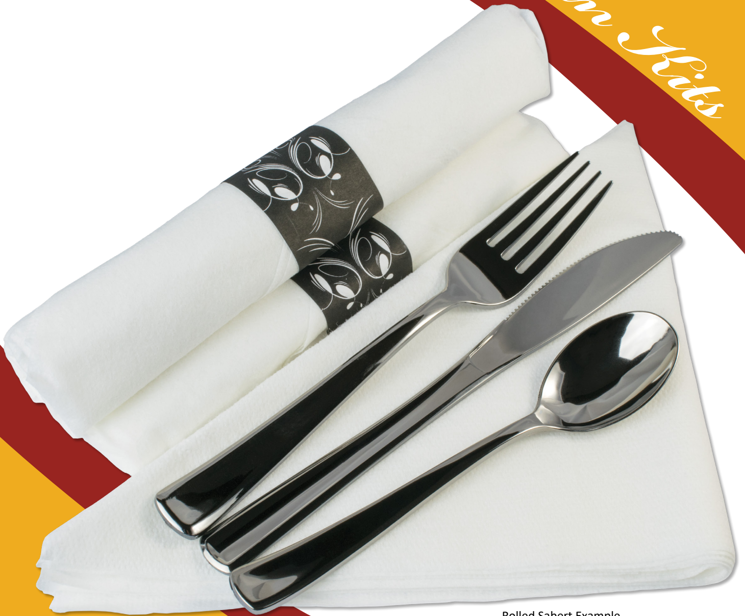
Rolled Sabert Example